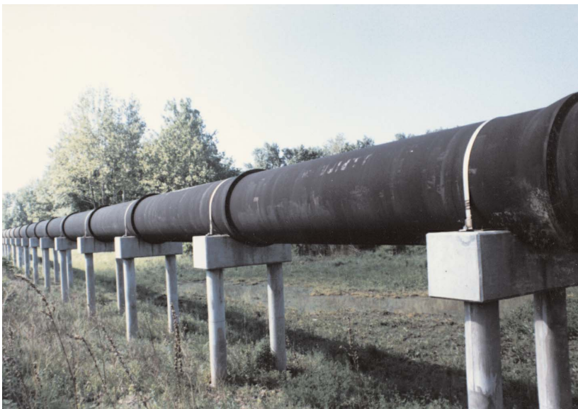
Ductile Iron is well-suited for use in pipe-on-supports applications due to its tremendous beam strength.

Due to the conservative approach of this design procedure, and in the interest of simplicity, combinations of external load and internal pressure to obtain principal stresses have not been considered. The design engineer may elect to investigate principal stresses due to extraordinary circumstances, e.g., very high internal pressure, etc.